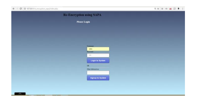
Fig.4.Upload files to share with another user

Login by second use (Payal) and files are decrypt and download by second user using key. If this second user wants to perform write action it simply download the file and done write action and upload again this file. Write operation perform to change the content of file. After changing and uploading this file is new updated data file. This second user wants to share file with another user i.e. third user. It chooses the access type (write or read) and select user to share data or file. Here select the third user (Pankaj) and grant read access type. File is shared between second and third user using re-encryption. The reencryption is done by ECC and by generating another key. Then perform logout by second user (Payal).