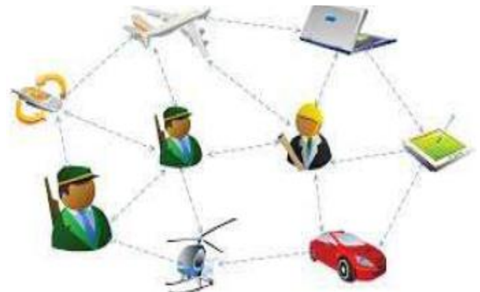
Figure 1: Mobile Ad-hoc Network (MANET)

Efficiency and the life of the network can be improved by routing protocols. On demand and hybrids are the solutions for the protocols [2].