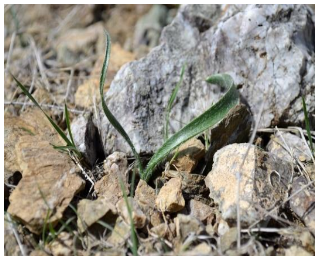
Fig.1. Allium Alaicum. [Near osh]

scale of the species we are studying is Andijan and Osh regions. To date, 50 allium alixes belonging to 2 populations have been identified [2]. As we can see, the division of the region is observed in this plant, which is one of the main signs of decline [3]. Features such as environmental variability, resilience, and resilience may be reduced or completely lost for this species. More than 250 species of allium are found in Central Asia and Southwest Asia. In Central Asia, populations of especially tasty and medicinal wild allium have been growing for many years. Detailed information and understanding of the population can be found in Dobransky-1968. Onions and garlic are eaten in these parts of Central Asia. There are more than 80 endemic species in the region [4], and data on the use of such species by the local population may play a key role in the conservation of the endangered species. That is, Allium Alaicum can be consumed by the population, and people living in such an area value onions as "Allium motor camelin Levicher" (motor, moy-moddor, modor – means in Tajik language health).