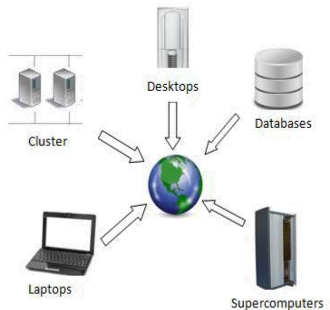
Figure 1: Grid computing

Selection and sharing resources worldwide is the fundamental working logic behind grid computing can be represented by Figure.1: