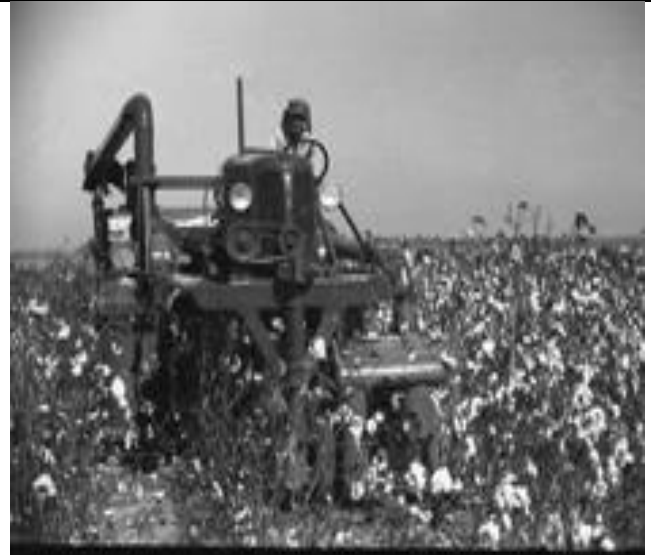
Fig. 4 Cotton Picking in 1930

In the late 1930's, as shown in Fig. 4, the first one row cotton picker was developed by John Rust but was not commercially sold since the picker proved to be less durable and so the inventor was reluctant to sell many [8].