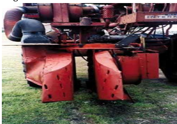
FIG. 14 PNEUMATIC COTTON PICKER

The pneumatic cotton harvesting apparatus as shown in Fig. 14 includes a plurality of harvesting heads arranged in adjacent spaced relation side by side with each having a side panel opposing a side panel on an adjacent opposing harvesting head. An air intake manifold within each side panel has a plurality of extraction units with air intake ports for harvesting of seed cotton. The extraction units are each arranged in a staircase configuration to extract cotton into a pass through chamber housed within the harvesting head. The cotton is transferred through the air plenum transfer chamber attached to the harvesting heads to a cotton storage container. Air supply nozzles arranged before the extraction units aid the extraction of cotton by blowing air on the cotton plant before entering the extraction units to loosen the cotton. Horizontal ledges above and below the air intake ports and raised deflectors forward and rearward of the of the air intake ports deflect the cotton plants away from the air intake ports and support the vacuum mechanism for extraction of the cotton seed through the extraction.