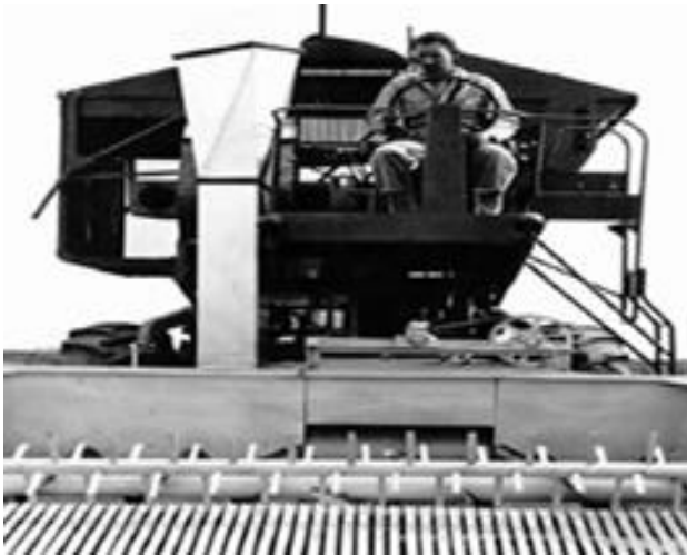
Fig. 11 Cotton Stripper

Cotton strippers as shown in Fig.11 are used as an once-over harvest machine. Found in areas where weather conditions prevent repeated harvests, strippers 'pull' the entire boll, ripe or not or sever the stalk near the surface of the ground and take the entire stalk, together with cotton bolls into the machine and another machine is used to remove the burr and vegetative matter.