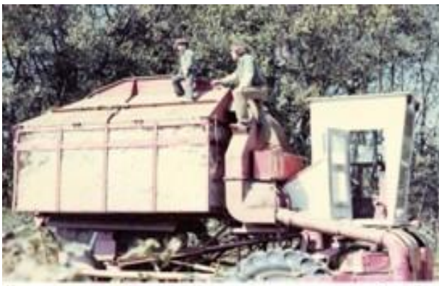
Fig. 7 Cotton Picker with Cabin

From the 1960's to 1980's, various modifications were made in the cotton pickers as shown in Fig.7, keeping the basic concept same. In the 70's the first picker with a driver's cabin was introduced. This ensured the driver's safety and comfort making working on fields a pleasant experience [8].