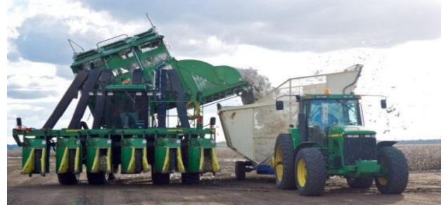
Fig. 9 Multiple Row Big Basket Cotton Picker

In the late 90's, as shown in Fig.9, the six row cotton picker had been introduced with a large basket on the back this new picker made cotton picking much faster and easier as the cotton was just tipped into a module builder where it was pressed [8].