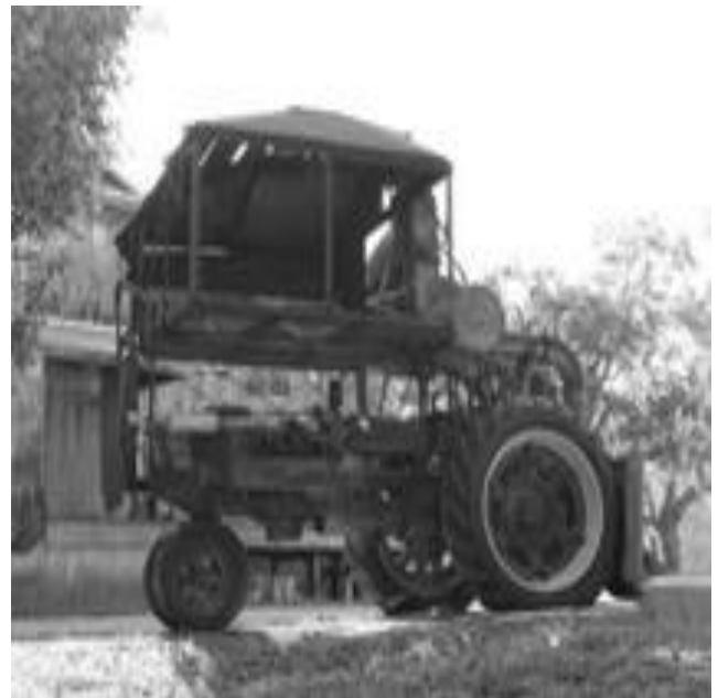
Fig. 5 Cotton Picking in 1940

Then in the early 1940's, as shown in Fig. 5, the cotton picker was commercially made and sold. The barbed spindles would pick the cotton off the plants and would drop it to the ground this did potentially degrade the cotton but it was mechanical and this meant less labor [8].