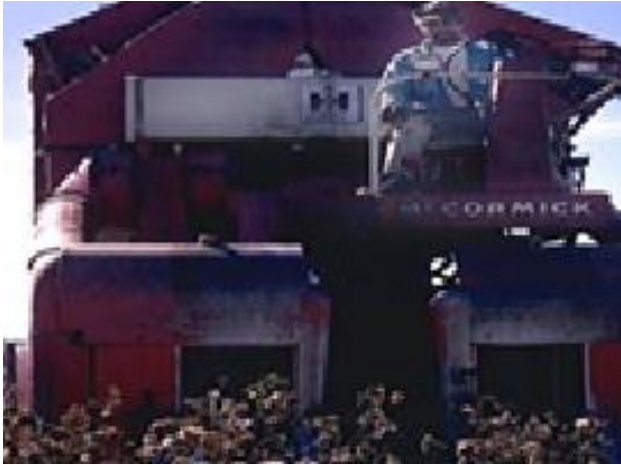
Fig. 6 Cotton Picking in 1950

From the 1960's to 1980's, various modifications were made in the cotton pickers as shown in Fig.7, keeping the basic concept same. In the 70's the first picker with a driver's cabin was introduced. This ensured the driver's safety and comfort making working on fields a pleasant experience [8].