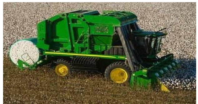
Fig. 10 Cotton Baler

In 2009, as shown in Fig.10, John Deere released the first round baler which picks the cotton, rolls it, places it in a tarp and drops it to the ground. Therefore, less manual labor was needed again and the module builders were no longer needed to press the cotton [8].