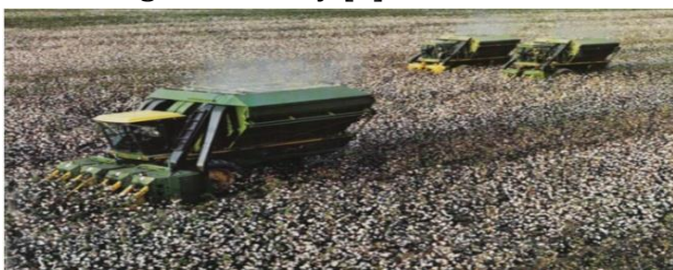
Fig. 8 John Deere Cotton Picker

The 4-row cotton picker, as shown in Fig.8, was introduced by John Deere in 1980 which increased operator's productivity by 85-95%. This increased the efficiency of cotton picking to a large extent and was welcomed by the farming community [8].