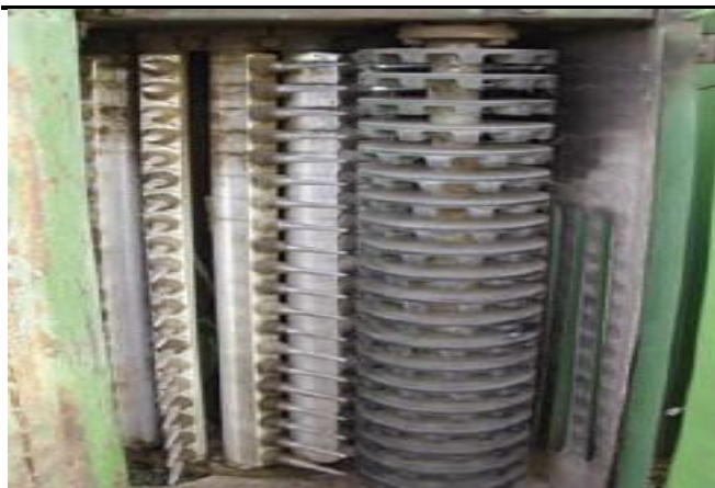
Fig. 13 Spindle and Doffer Arrangement

Spindle picker design is being modified to achieve increased speed and decreased weight is thought to have resulted in a general decrease in cotton fiber quality, particularly regarding spindle twists. Results of laboratory evaluation of different spindle designs showed that the smaller, straight spindle was more aggressive in removing cotton from the boll. There was approximately twice as much fly-off from the barbed spindle than from the smaller straight spindle. Field tests found that stalk losses in the field were significantly greater at a spindle speed of 1500 rpm than for speeds of 2000 rpm or greater for all varieties. This indicates that a spindle speed of at least 2000 rpm is needed to minimize picker losses. Stalk losses were greater with speeds of 3000 and 4000 rpm than for a speed of 2000 rpm.