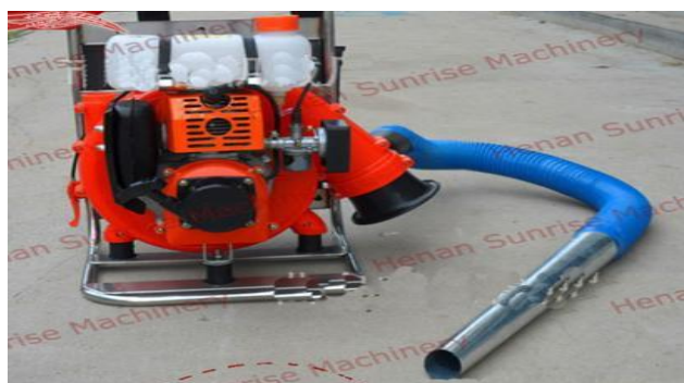
Fig. 16 Portable Pneumatic Cotton Picker

trash of the plant with it. If trash gets trapped in cotton then it is very difficult to separate trash from cotton, cotton being a very fibrous material. Time required for cotton picking by pneumatic cotton picker is more as cotton from boll cannot be picked at a time. Weight of the machine also increases due to use of compressor or blower for generating vacuum. Operator has to be skilled before using machine to pick the cotton efficiently. Due to all these constraints pneumatic cotton picker is not used worldwide.