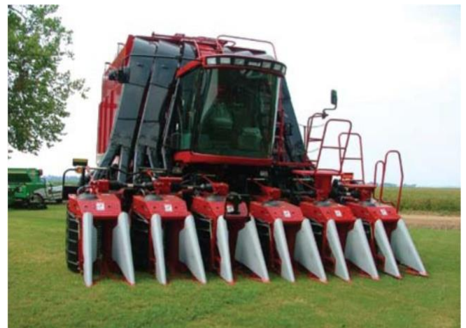
Fig. 12 Spindle Type Picker

A Spindle Cotton Picker as shown in Fig.12 does just 'picks' the cotton from the boll by means of revolving spindles fingers or prongs without material damage to foliage or unopened bolls. And a picker usually is used more than once since cotton is a continuous fruiting plant during the growing season. A picker may make repeated trips through cotton as the bolls ripen.