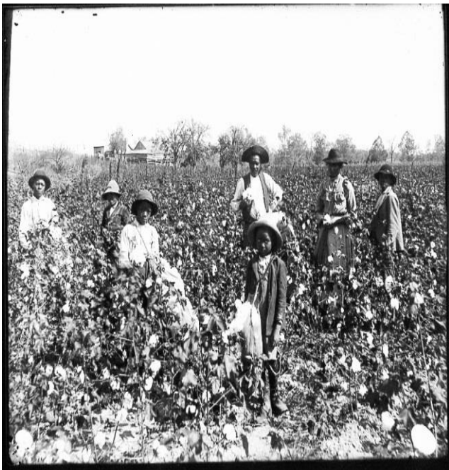
Fig. 3 Manual Picking in 1920

Starting from the early 1920s, cotton was still picked by hand and caused a lot of manual labor; people would go day by day picking the flowers from the plants placing them in bags continuing the traditional cotton picking which was in place since long as shown in Fig. 3.