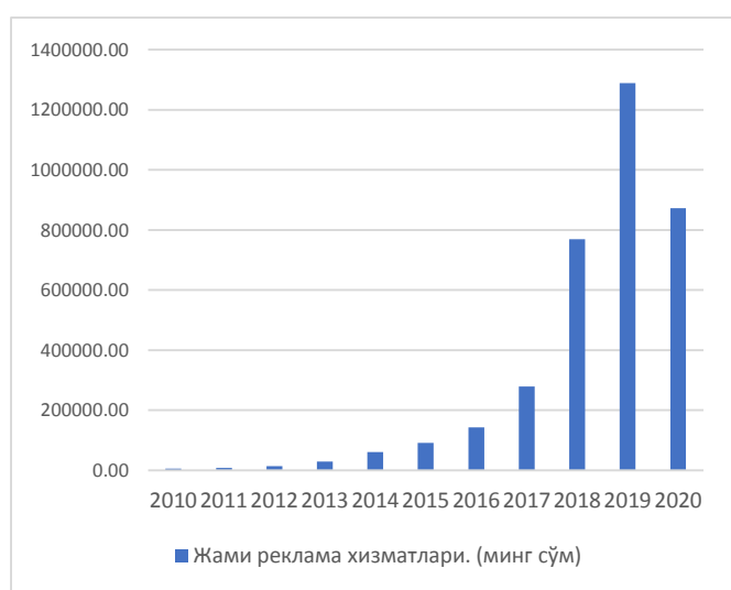
Figure 1. Dynamics of advertising services in Samarkand region

A histogram of the distribution of advertising services is shown in the diagram above. As can be seen from this diagram, from 2010 to 2019, advertising services in Samarkand region grew exponentially. In 2020, it will decrease by almost 30% due to the negative impact of the pandemic.