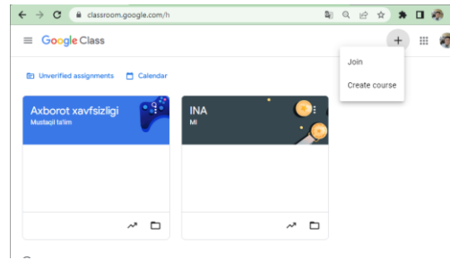
Figure 1. The main menu of the Google classroom platform.

section, select the Classroom button and go directly to the platform by pressing the button (Figure 1) [2].