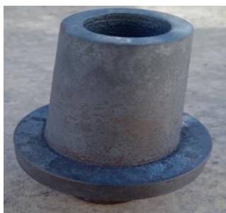
Fig. 1. The finished part “Picabur body”

So, having analyzed the "Picabur Body" part (Fig. 1.), we can say that the part is axisymmetric, having a flange in the middle part of the part. The following should theoretically describe the process of combined extrusion.