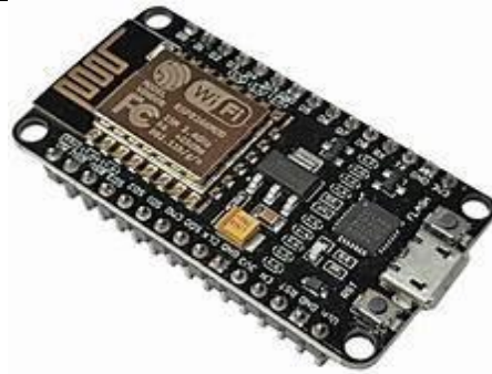
Fig. 2: ESP8266 (NodeMCU)