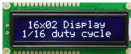
Fig. 4: LCD 16x2 Display

The 16x2 LCD module is widely used in embedded systems to display alphanumeric data. It is based on the HD44780 controller and can display 32 characters across two rows.