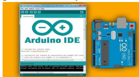
Fig. 7: Arduino IDE Software