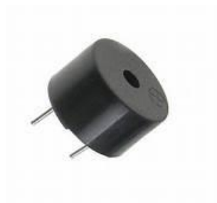
Fig. 3: Buzzer

A buzzer is an audio signaling device that converts electrical energy into sound. It can be active or passive and is commonly used for alerts and user feedback in electronic systems.